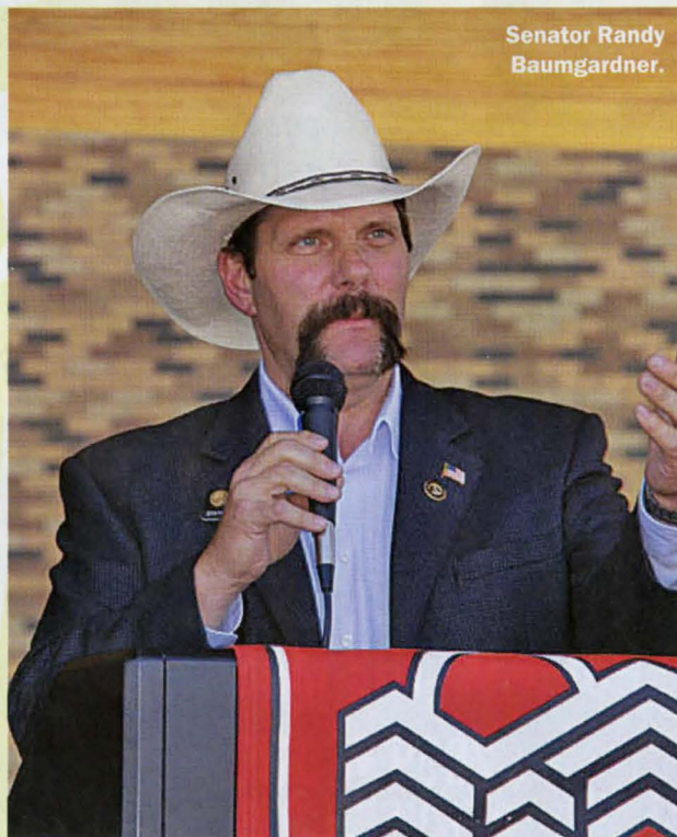
Senator Randy Baumgardner.